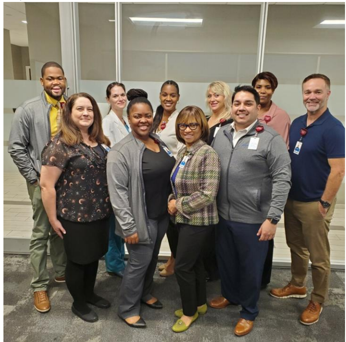
AdventHealth Community Care Team

*Total patients served for Orange, Osceola and Seminole County in 2019