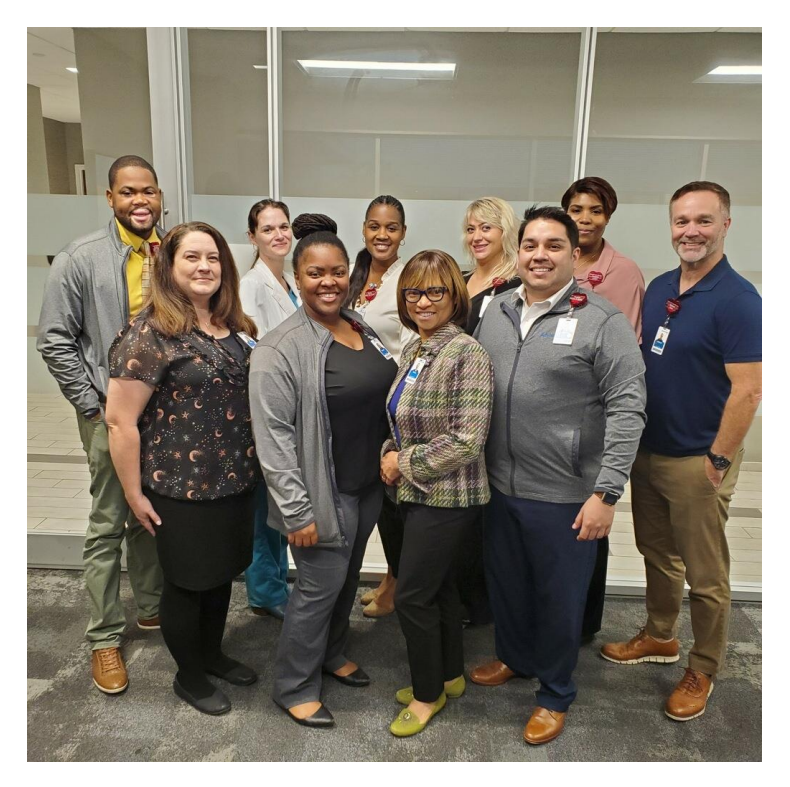
AdventHealth Community Care Team

*Total patients served for Orange, Osceola and Seminole County in 2019